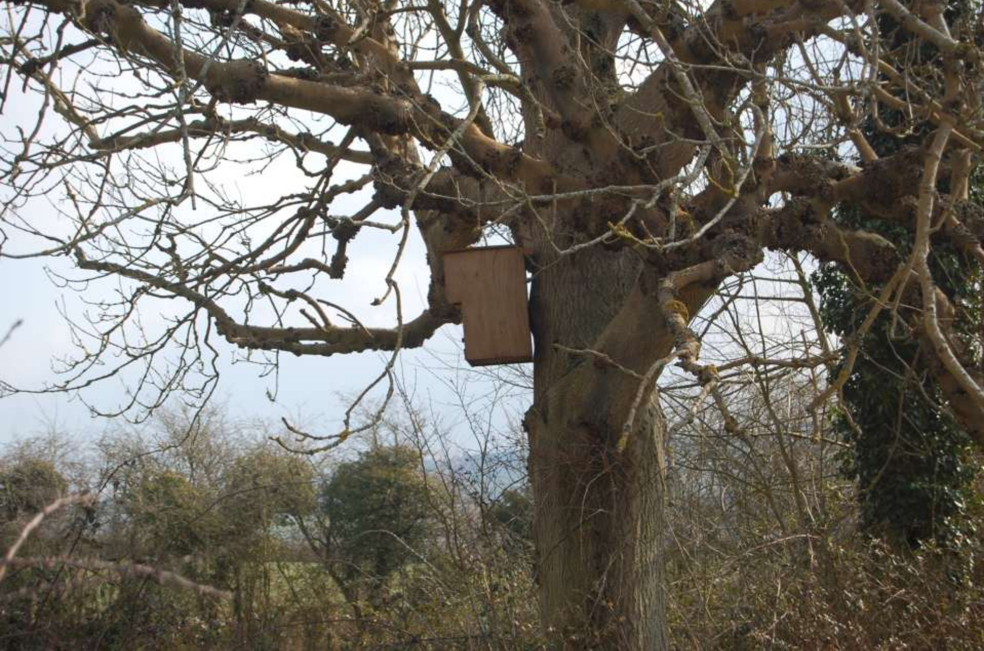
Owl box at Honeydale Farm